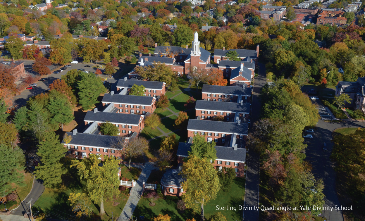
Sterling Divinity Quadrangle at Yale Divinity School